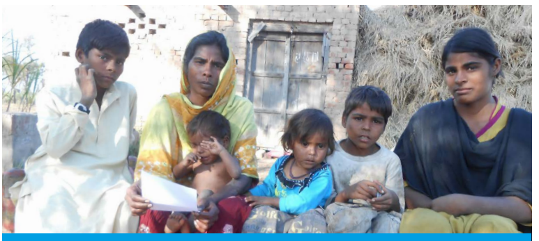
One of the images used for "participatory reflection" exercises for engaging women.

The women were encouraged to share their own experiences and questions and to take part in activities to explore the impact of childbirth and birth control on the overall quality of life and family well-being.