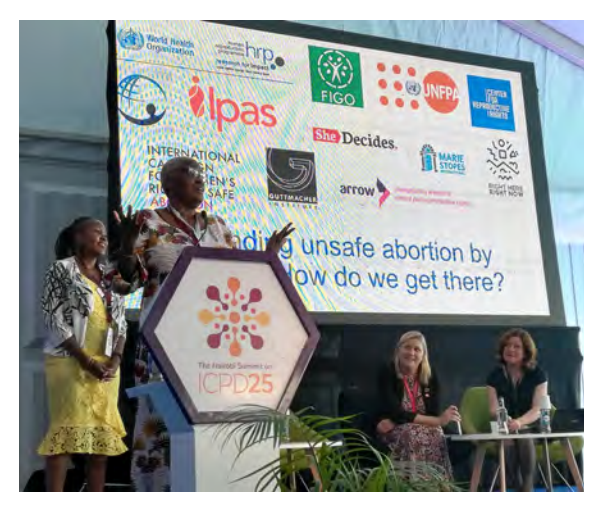
Above: Hon. Dr Ruth Labode MP, Chair of the Health Select Committee, Zimbabwe, addresses an event on ending unsafe abortion at the ICPD+25 Summit in Nairobi, 2019.

We partner with governments, operating as part of national health systems while also challenging and advocating for the removal of restrictions and to implement existing policies to their fullest extent. We are active in civil society advocacy spaces while also working as part of government policy processes through, for example, participation in technical working groups and government policy committees – acting as a link between civil society and policy processes. We advocate at national and sub-national level for changes in health system programming priorities, financing, and provider training and behaviour to ensure that policies and guidelines are understood and implemented.